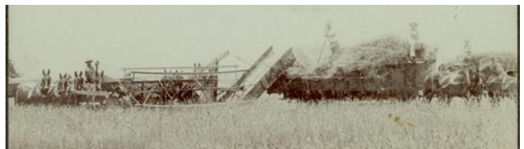
A mowing machine, also called a "header". The horizontal blades gather the cut grain, and it is loaded onto a wagon traveling next to the team via a conveyor belt. Williams photo 1964-12

2-minute movie of steam engine threshing