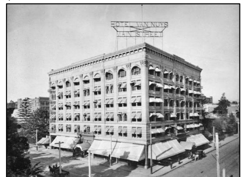
1897 Van Nuys Hotel, N/W corner of Main and 4th Streets.