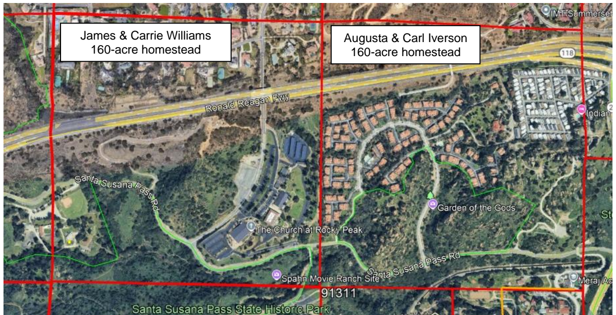
Google Earth overlay of the Williams and Iverson Homesteads